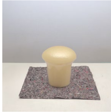
Full reaction time approx. 150 sec