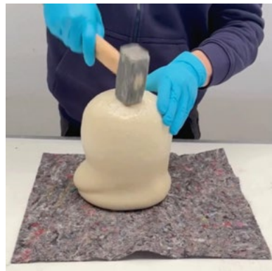
High mechanical stability