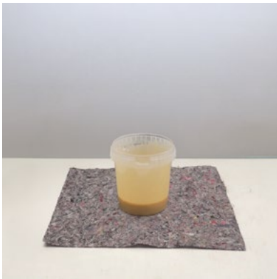
Start of reaction approx. 30 sec