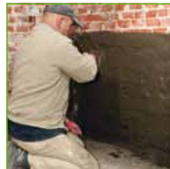
KÖSTER KD 1 Base