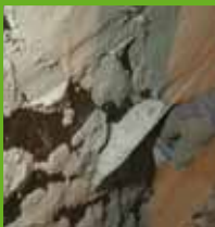
Application of KÖSTER restoration plaster