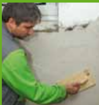
Smoothing the surface

Apply KÖSTER Polysil® TG 500 as a primer in order to strengthen the substrate and reduce the mobility of the salt molecules. KÖSTER restoration plasters are available in grey or white. In historic buildings they can be used as a decorative plaster even without painting. They are suitable for interior and exterior use.